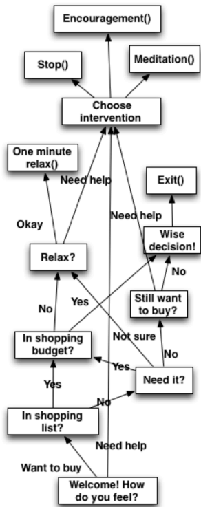
Figure 2. Workflow of Mindful Shopping

with CBD who want to change their buying behaviors. In addition, this tool may have broader appeal for individuals without CBD, but who still seek to be more mindful during shopping.